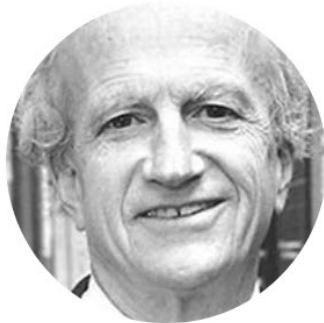
Gary Becker Nobel-Prize Winning Economist