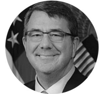
Ash Carter U.S. Secretary of Defense