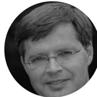
Jan Peter Balkenende Prime Minister of the Netherlands