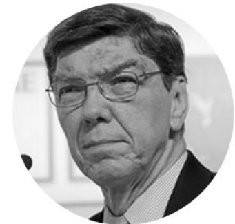
Clayton Christensen Author and Academic