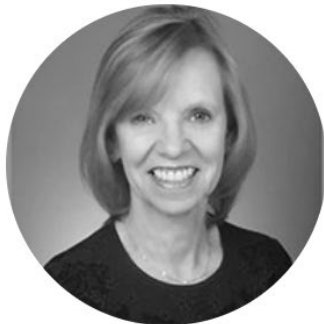
Ann Winblad Venture Capitalist